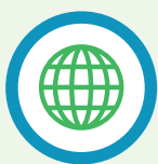
Future Food Centre