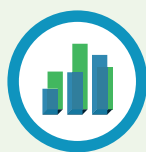
Advanced Analysis Centre